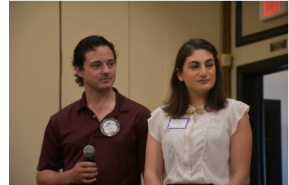
Volunteer to be a Reporter

Members of the Club and Community Avenues of Service as well as the New Members, Paul Harris, and Program Committees are particularly encouraged to apply or submit club information to share with our members and the community.