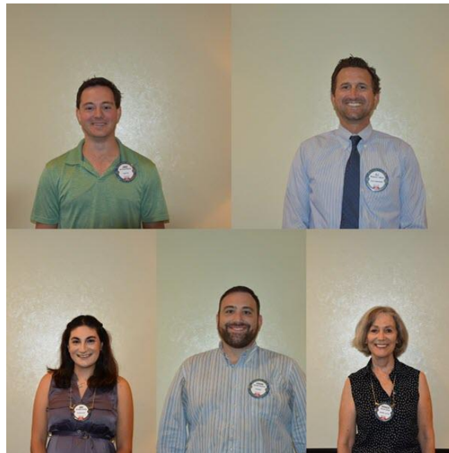
North Fresno Rotary's Newest Members

The Rotary Club of North Fresno is a volunteer organization whose members take action to create sustainable change in our community and around the world